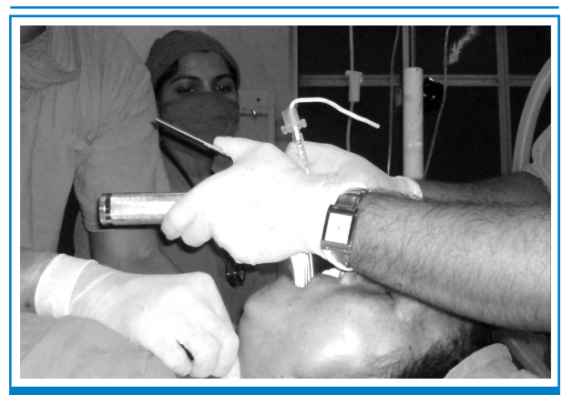
Figure 2. McCoy laryngoscope aided tracheal intubation in presence of limited neck extension.