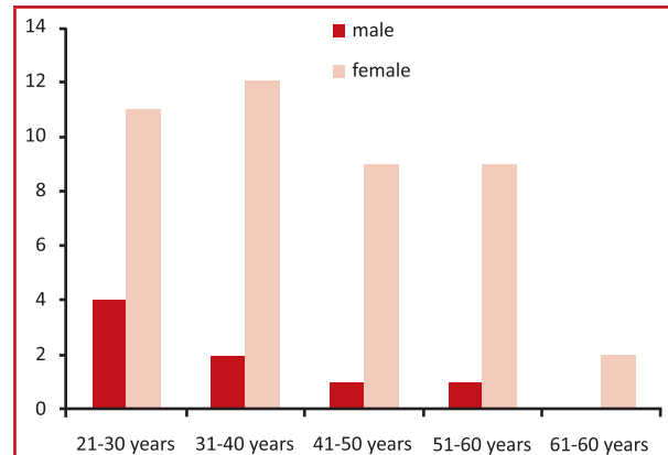
Figure 1. Age and sex distribution of thyroid swellings

for radio iodine ablation therapy and were kept under regular observation. One patient with anaplastic carcinoma developed superior venacaval syndrome and succumbed in three months time. The accuracy of FNAC was assessed by using SPSS 10.0. Over all sensitivity and specificity were calculated as 70% and 97.5% respectively with accuracy of 92.1% (Table 1, 2).