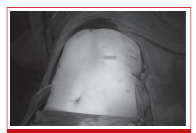
Figure 1. Port placement

All the patients undergo preoperative workups. CBC, LFT, USG, CXR are done and the patients who need exploration of common bile duct are explained about the procedure and study.