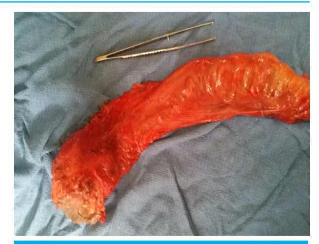
Figure 3. Cylindrical Specimen of rectum with anal canal and sigmoid colon removed.

Patient recovered well and was discharged on day 5. Perineal wound was healed completely on day 10 follow up. Histopathological result showed GIST of maximum tumor dimension 6.2 cms with free resected margins and with 8 mitotic figure per 50 High Power Field (HPF); pathological staging being T3 N0 Mx. She has been started on adjuvant imatinib therapy and a regular follow up planned.