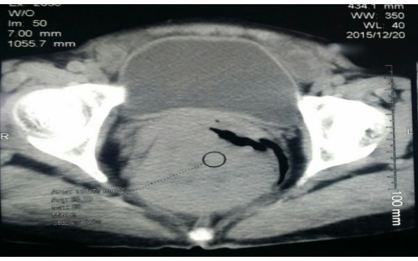
Figure 1. Mass in rectum completely occluding the lumen and compressing the cervix.